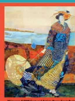
All images © 2018 Featured Artist: Nancy Frost Begin