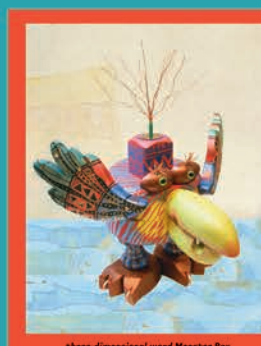
three-dimensional wood Monster Box